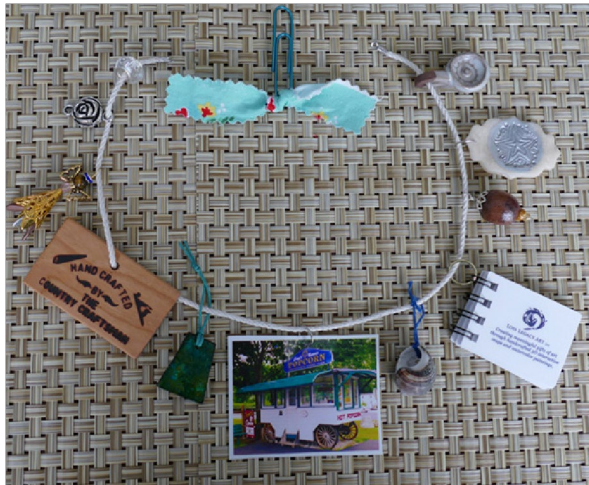
samples from 2018